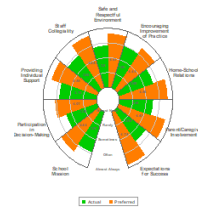
School Organisational Climate

Staff at St Joseph’s feel they are supported in improving and refining their practice.